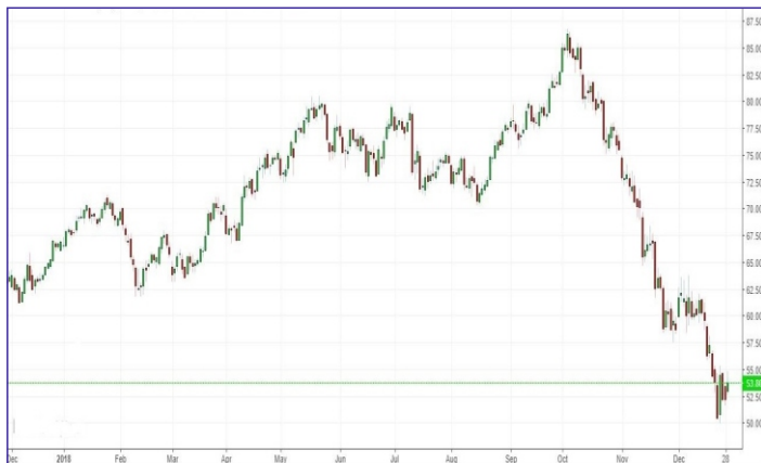
Brent crude price movement